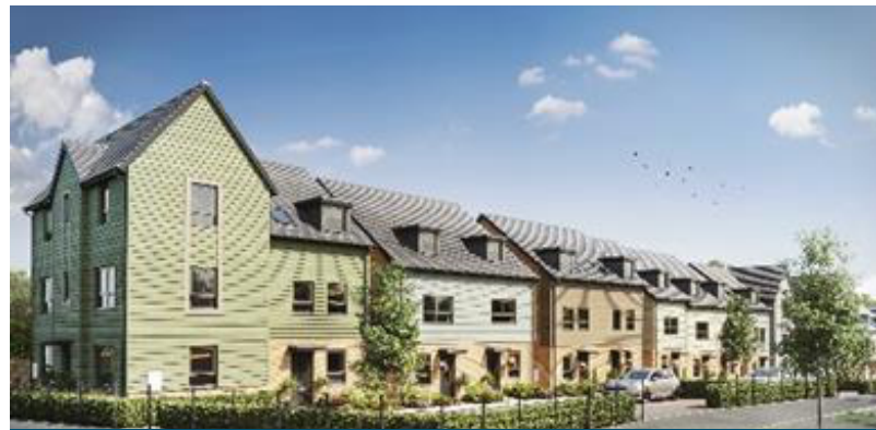
BARRATT HOMES HOUSE TYPES

All sales visits are strictly by private appointment only, or alternatively, sales advisors remain on hand over the phone, or by virtual appointment. The Barratt sales office at Glenvale Park will be launched at the beginning of March with show homes by the end of March and first residents taking occupation in the Summer. To find out more visit www.barratthomes.co.uk or call 07884 80125.