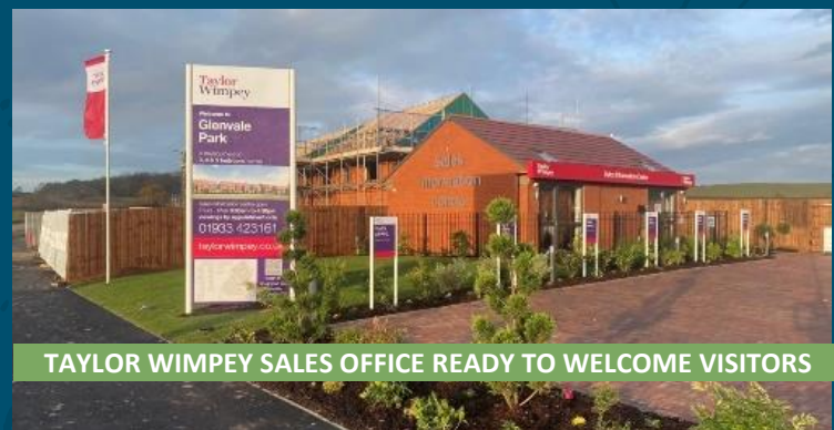
TAYLOR WIMPEY SALES OFFICE READY TO WELCOME VISITORS

Taylor Wimpey launched their sales office on site in December and are pleased to announce that their show homes will be open by end of February. Viewings for the 3- and 4-bed homes will be by appointment only, or you can book a virtual appointment by calling our sales office on 01933 423161.